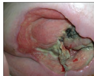
Figure 4: Pressure ulcer located on the sacrum, presenting with exposed bone, slough and granulation tissue

Staff and carers involved in looking after individuals at risk, or with existing pressure ulcers should use national guidelines on the prevention and treatment/management of pressure ulcers to ensure that best practice is provided. In addition, they should follow local protocols. This includes protection of vulnerable adults — that is, anyone aged 18 or over who is in need of community care services and is unable to look after themselves (DH, 2000).